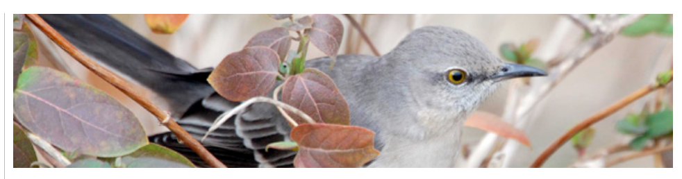
"Shoot all the bluejays you want, if you can hit 'em, but remember it's a sin to kill a mockingbird."

POSE. Bring your offspring to Lincoln Park's 1154 LILL store for A MOTHER/DAUGHTER PHOTO SHOOT. The snaps are free and the lucky winners of the contest will receive two $100 gift certificates to the purse-maker to be used in the future. May 8, 11 a.m. – 6:30 p.m., May 9, 11 a.m. – 6 p.m. Free. 904 W. Armitage Ave., (773) 477-5455, www.1154lill.com.